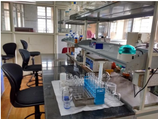
M.Sc. II Lab