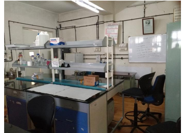
M.Sc. II Lab