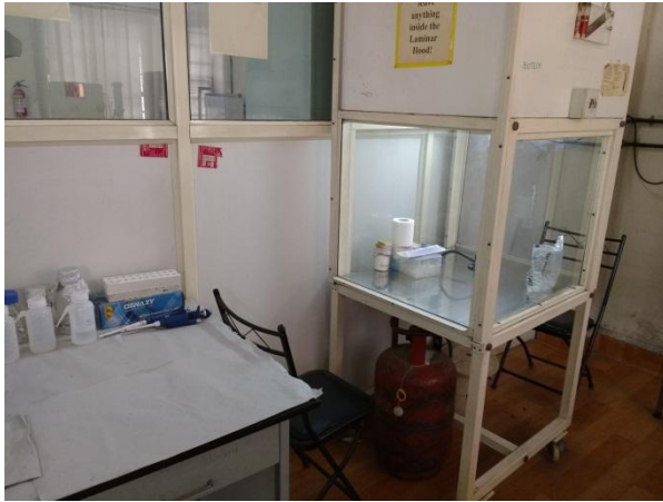
Laminar air flow